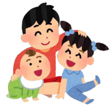
Income Limits for Child Allowance

For details, please contact the Children Affairs Division ( Kodomo-ka ) at ☎0276-63-3111(ext. 352).