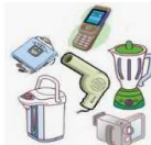
Free of charge