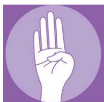
Palm to camera and tuck thumb.